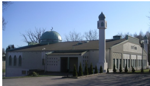
A multipurpose Mosque in Trollhättan (Sweden)