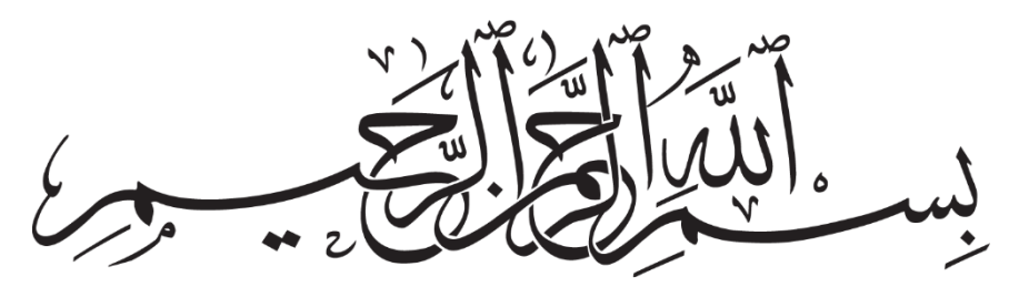
IN THE NAME OF ALLAH, THE MOST GRACIOUS, THE MOST MERCIFUL