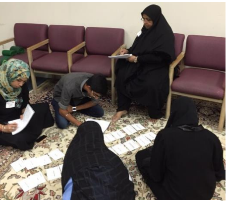
Learning through a card activity

"Excellent deomonstration which really related to the topic well."