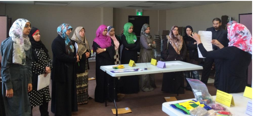
TST London participants experiencing the Multiple Intelligences activities

"The TST program has for sure opened my mind as to how to deal with generation Z."