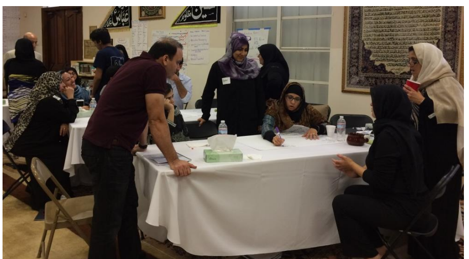
Brainstorming ideas for planning a lesson

The program emphasizes on the practical application of Islam to a Child's life in a way that is positive and age appropriate.