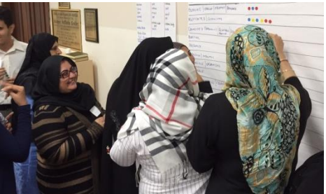
Involved in a democratic learning process

The TST program focuses on using skills and tools to practise a Student centered approach to learning where every student's