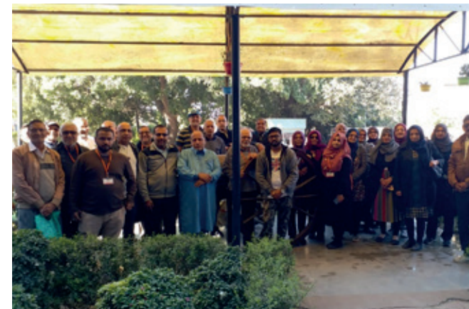
Visiting Kutch Museum