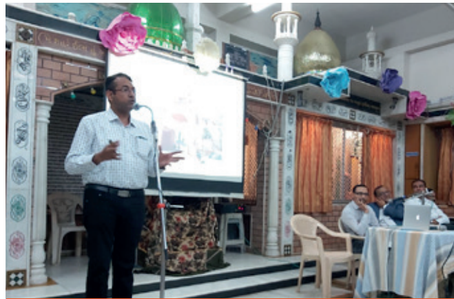
Khoja Symposium - Sarkhej Jamaat