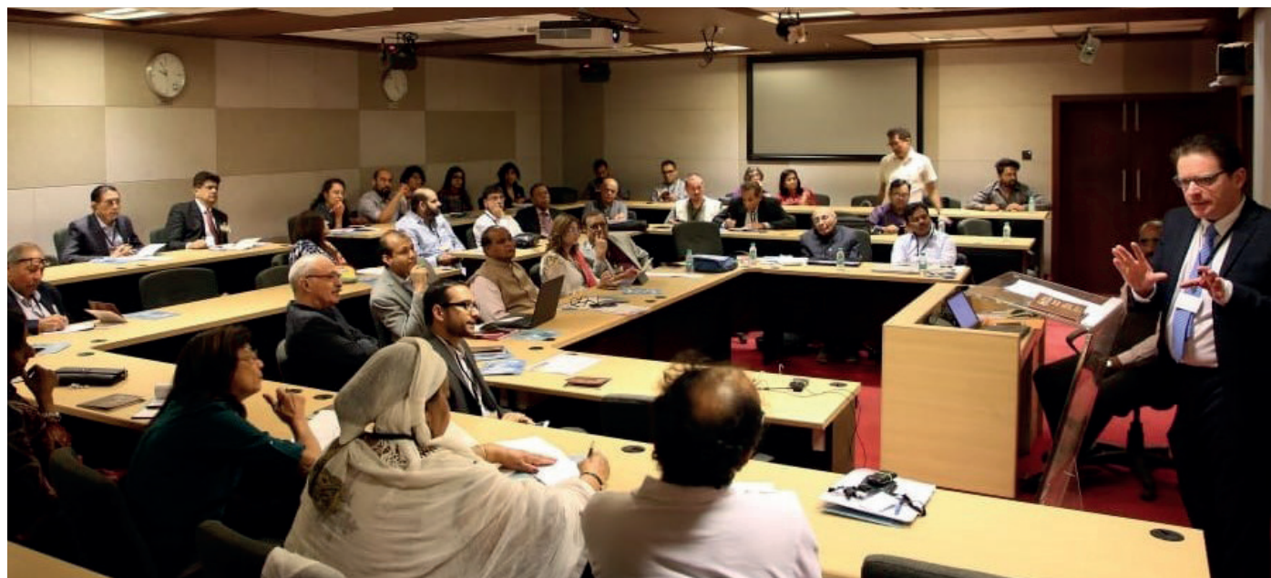
Khoja Studies Conference, Mumbai 2019