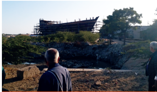
Visiting Shipbuilding Yard