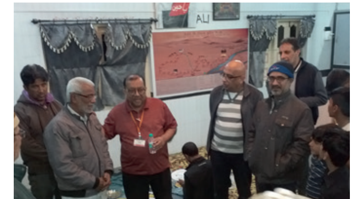
Bonding with Community