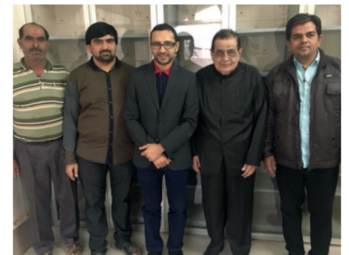
Funding Library, Nagalpur