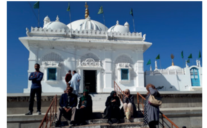
Peer Gulam Ali Shah Dargah - Kera