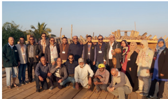
At Upper Deck of Ship