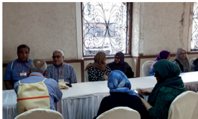
Khojas at Khoja Masjid - Palagali