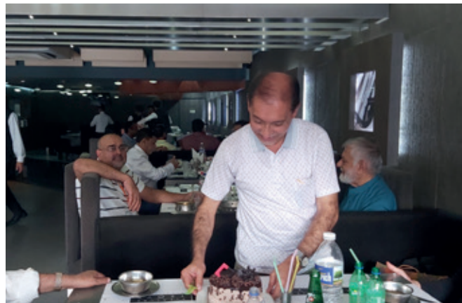
Birthday Celebration with Foodies