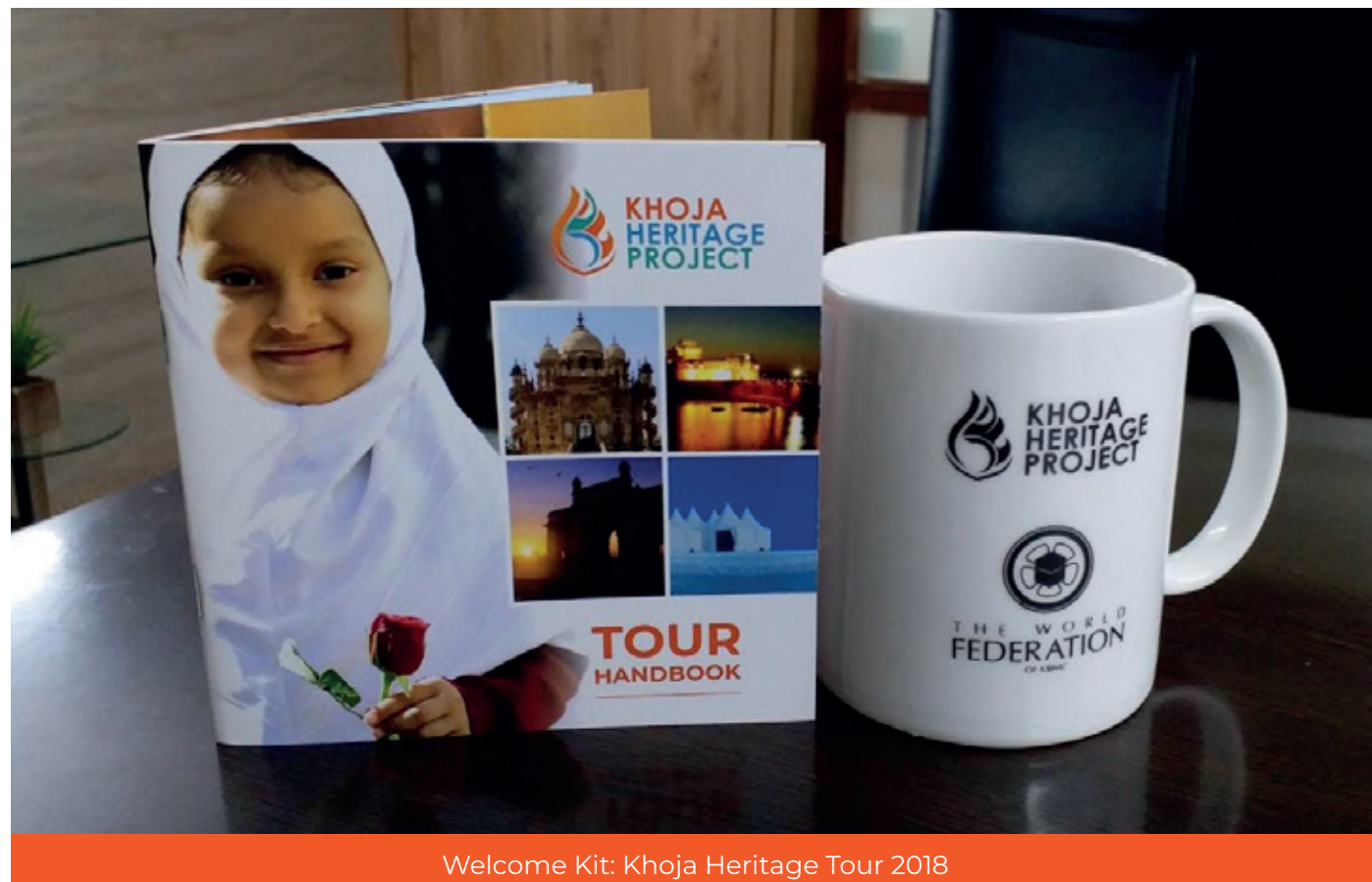
Welcome Kit: Khoja Heritage Tour 2018