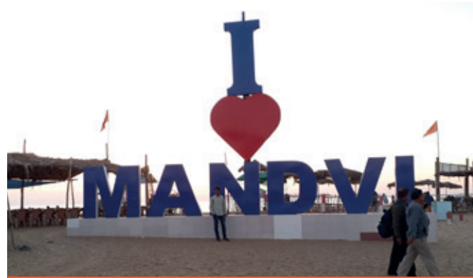
Sandy Beach of Mandvi