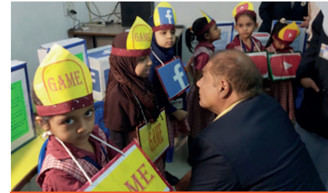
Little Stars of Mahdi School