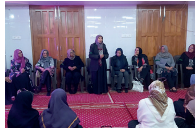
Warm Welcome by Bhuj Jamaat

BHUJ: Has come to be known as the synonymous of culture and heritage. It is house of ancient palaces, shrines of saint and beautiful temples. The sensation of this desert land is undeniably captivating.