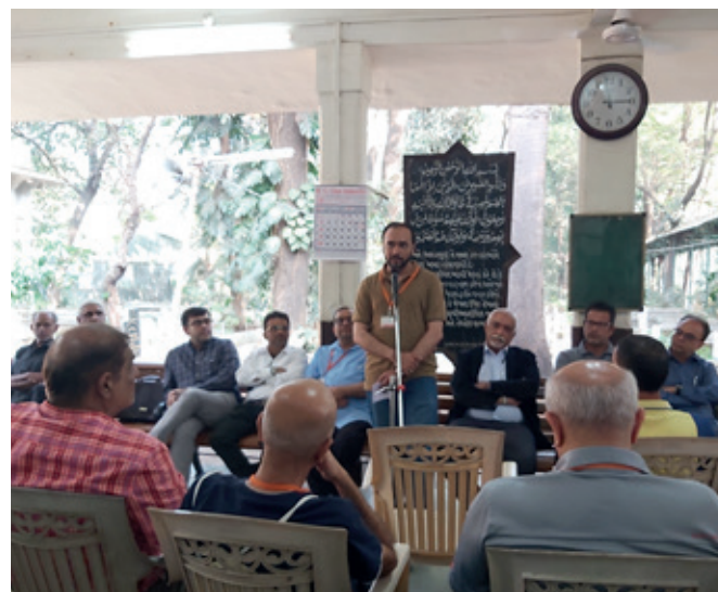
Introduction to Community Luminaries buried in Arambaug

No wonder why our ancestors migrated to this place from Kutch and Kathiawad in early 19th century.