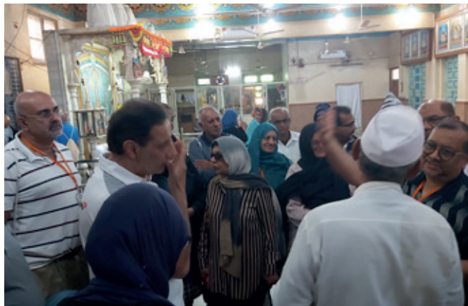
Introduction to Satpanth Tradition