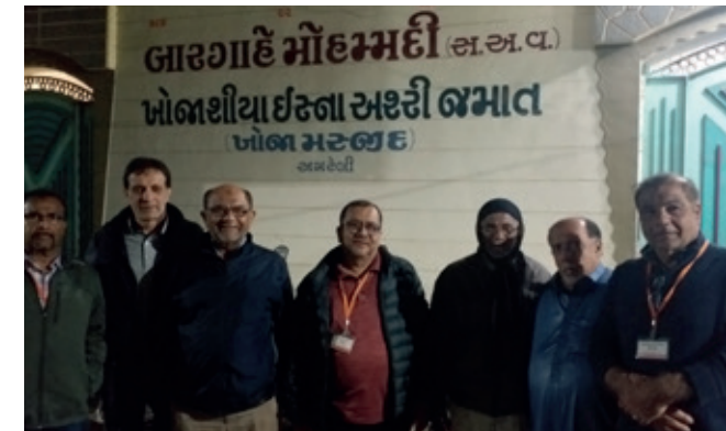
Amreli Jamaat Mosque