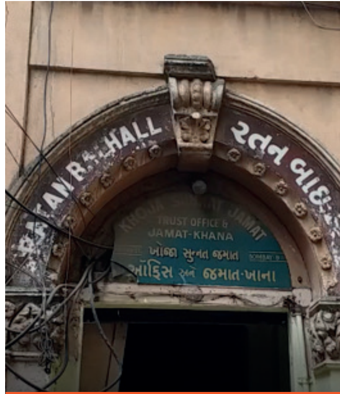
Khoja Sunnai Jamat-Khana, Mumbai