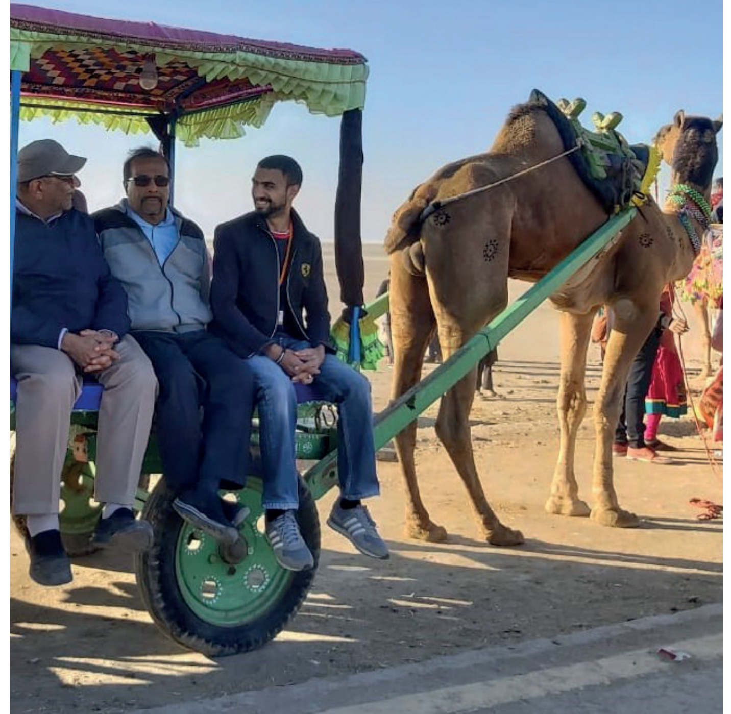
Camel cart ride in 'Rann of Kutch'