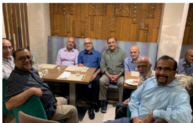
Early Bonding Days