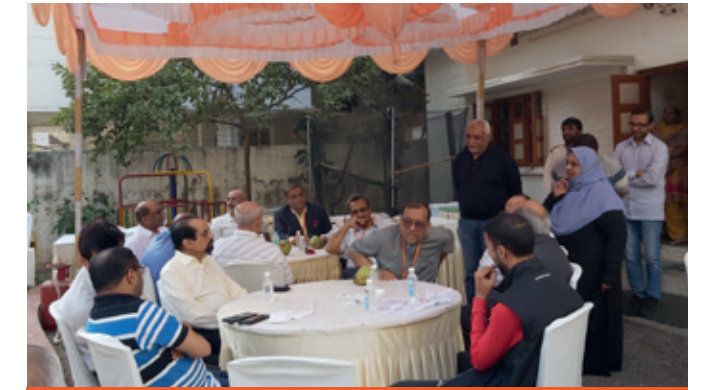
Visiting Umme Kulsum Trust