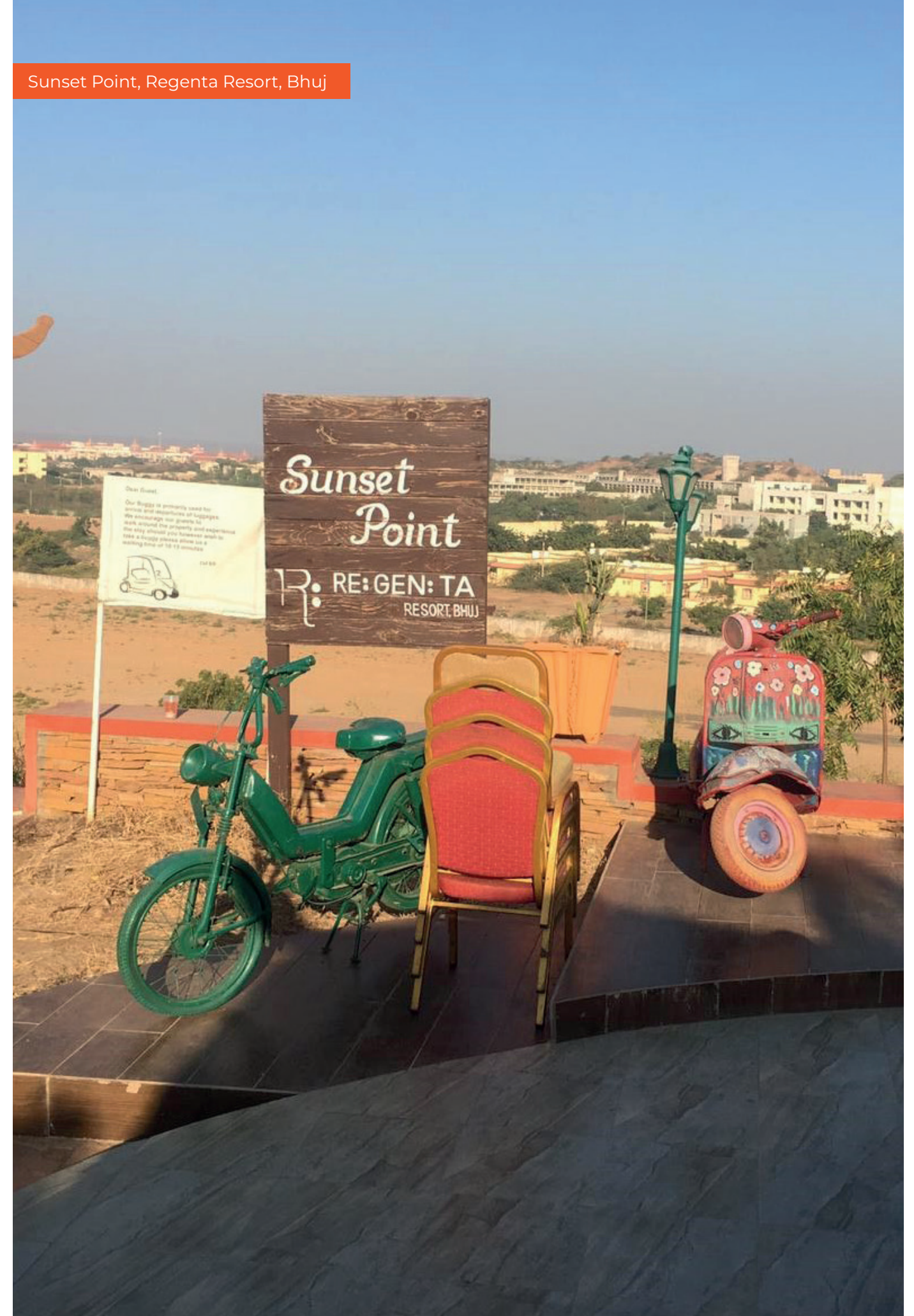
Sunset Point, Regenta Resort, Bhuj