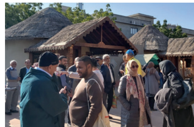
Walking through Kutchi Mud Huts