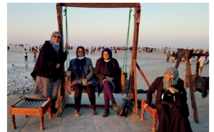
Traditional Wooden Swing in Rann of Kutch