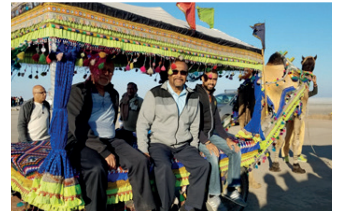
Camel Cart Ride in Rann of Kutch