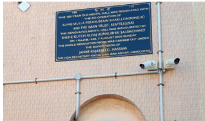
KSI Jamaat - Kera