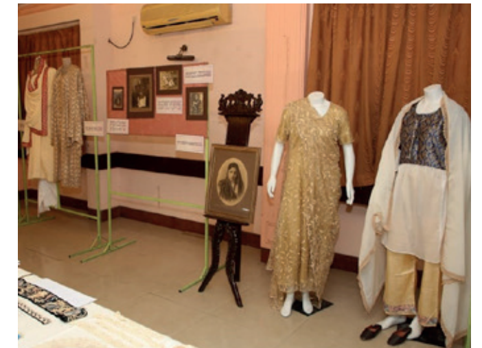
Khoja Heritage Exhibition 2019, Mumbai