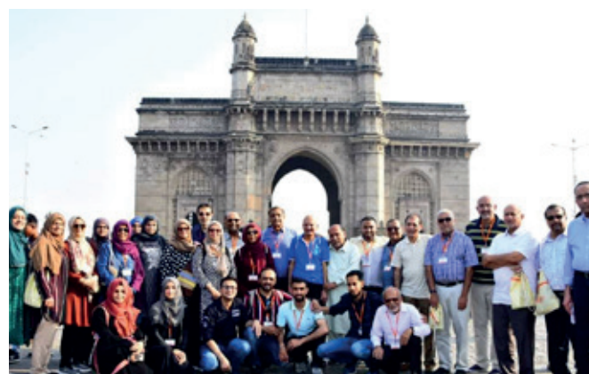
Gateway of India