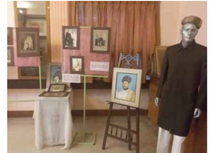
Khoja Heritage Exhibition, Mumbai