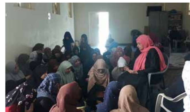
Mingling with the Locals