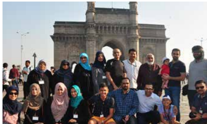
Gateway of India