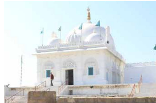
The Beautiful Peer Ghulam Ali Shah Dargah

BHUJ: Has come to be known as the synonym of culture and heritage. It is house of ancient palaces, shrines of saint and beautiful temples. The sensation of this desert land is undeniably captivating.