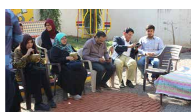
Visiting Umme Kulsum Centres