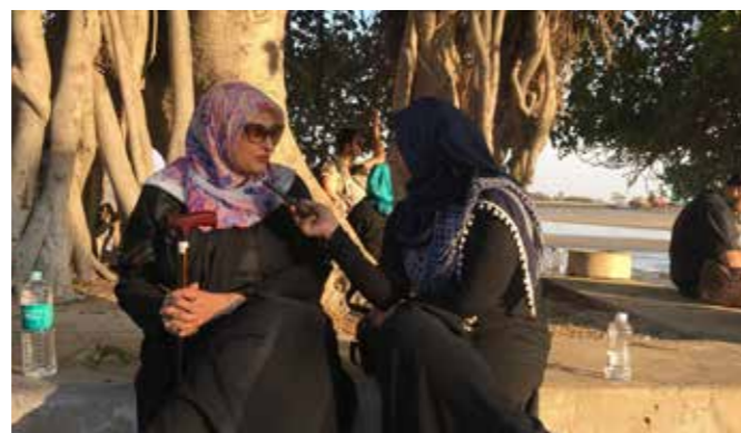
Learning History from Elders