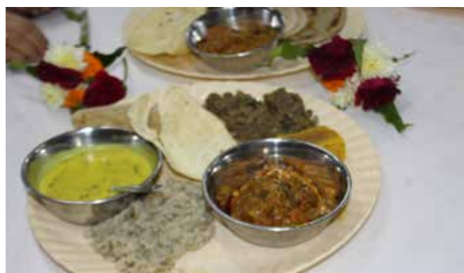
The Authentic Desi Thali