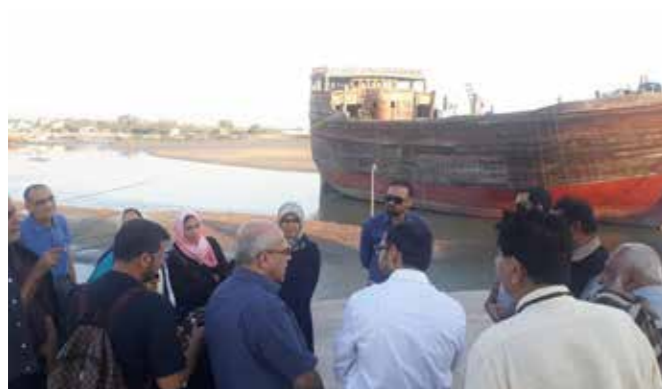
Visiting Shipbuilding Industry

KERA: Is a historical town of the Kutch district. The most significant place of interest for a Muslim visitor is the shrine of the 15th century mystic, Peer Ghulam Ali. The aura of the mausoleum inspires tranquillity, perhaps the most important lesson this sage would have ever given.