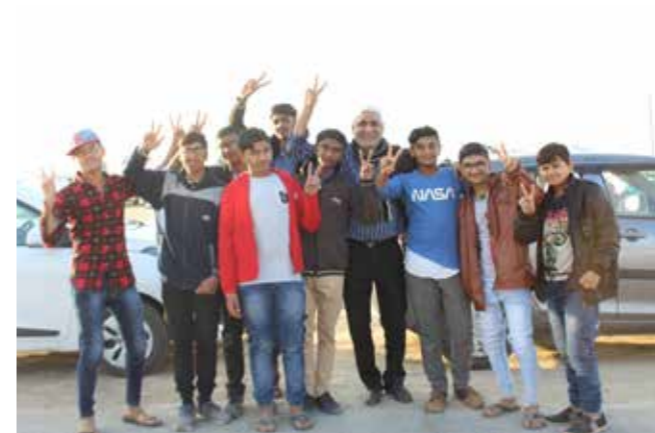
Posing with the Hostel Kids