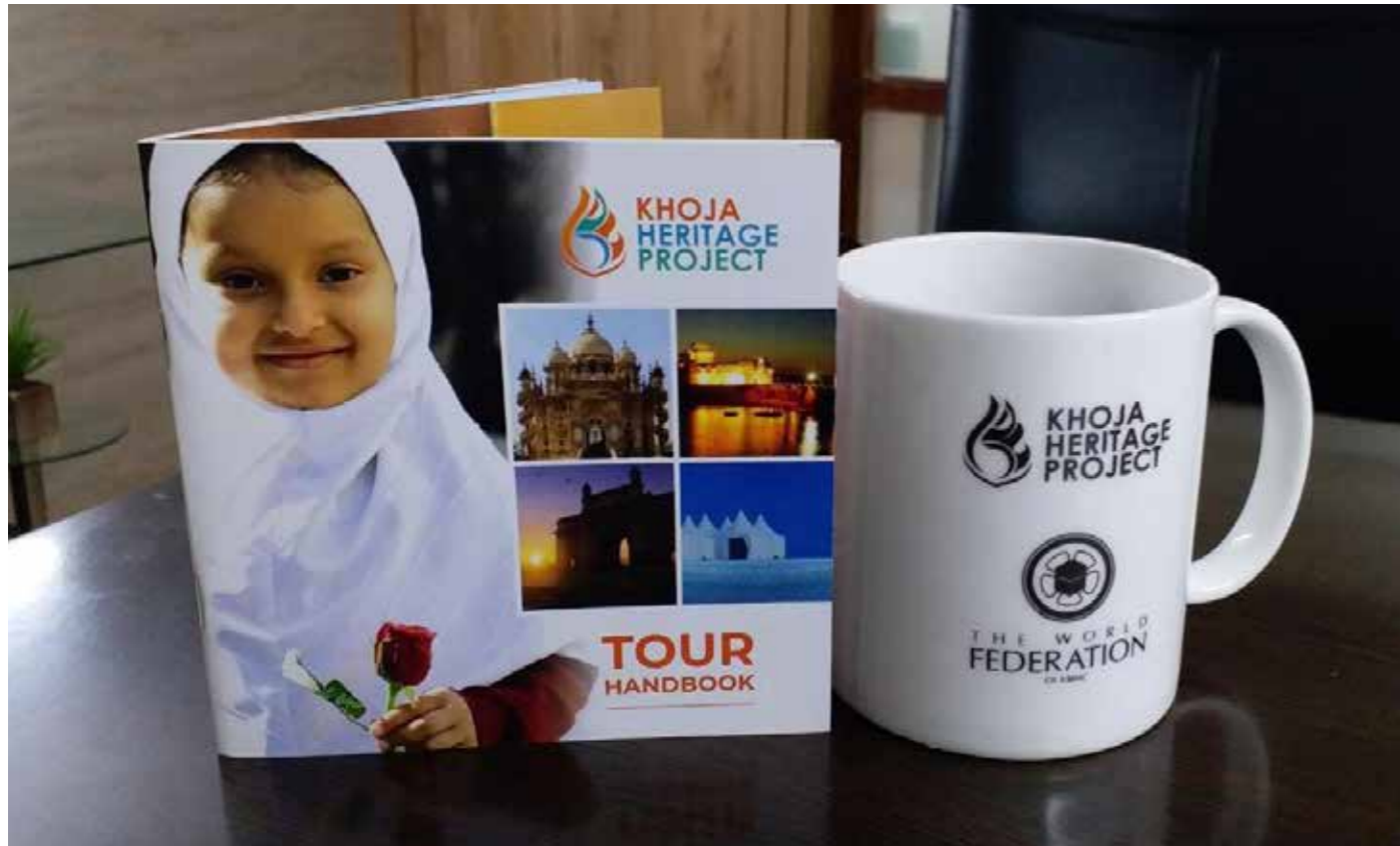
Welcome Kit: Khoja Heritage Tour 2018