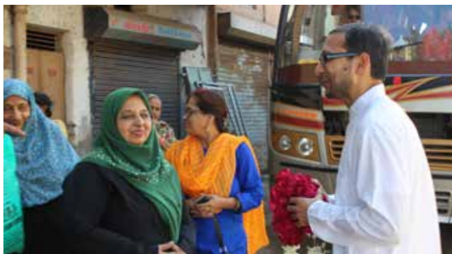
Farewell to Bhavnagar