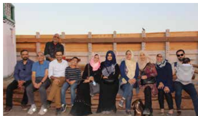
In the ship, Mandvi