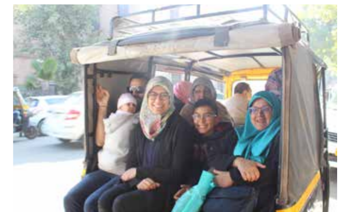
Enjoying the Auto Ride