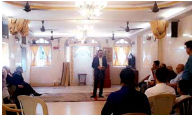
Opening Ceremony at Mulla Qadar Mehfil

MUMBAI: The name of this largest city of India is associated with trade, finance and commerce. A land of opportunity!