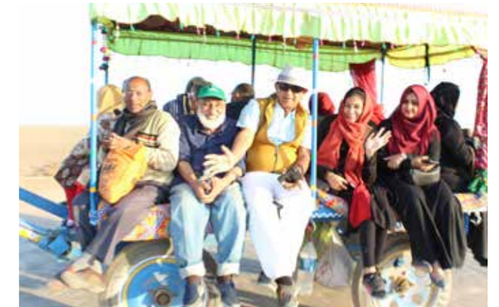
Camel Cart Ride at Rann of Kutch