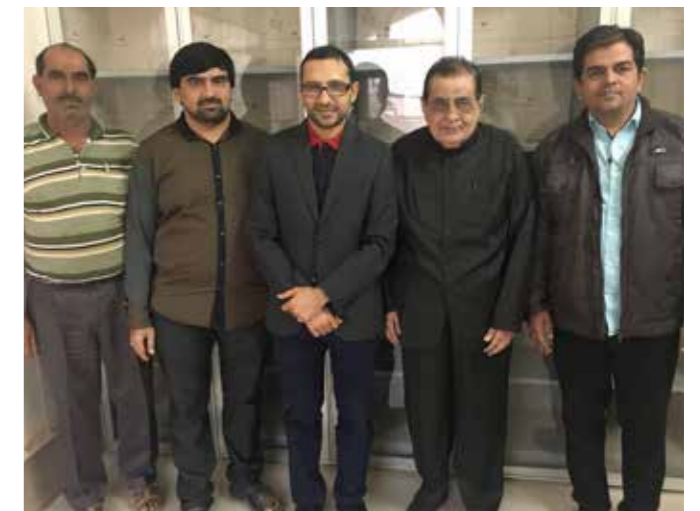
Funding and restructuring library, Nagalpur