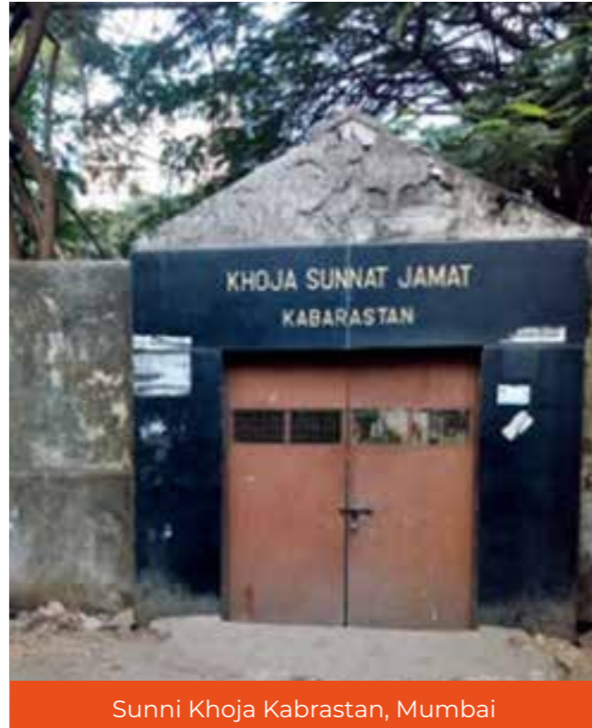
Sunni Khoja Kabrastan, Mumbai