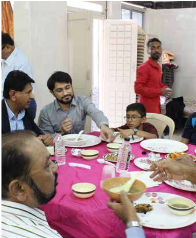
Breaking Bread with Community Members

The largest city of Gujarat claims its name from the founder of this city, Ahmad Shah I. It has since been the political and economical capital of the state of Gujarat.