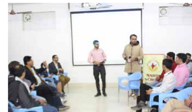
Interacting with the Youths at Mehdi School