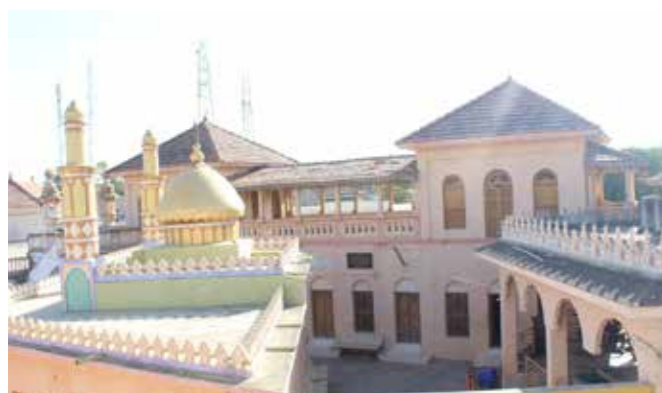
KSI Jamaat, Kera