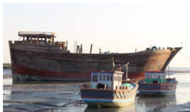
Serenity of Mandvi