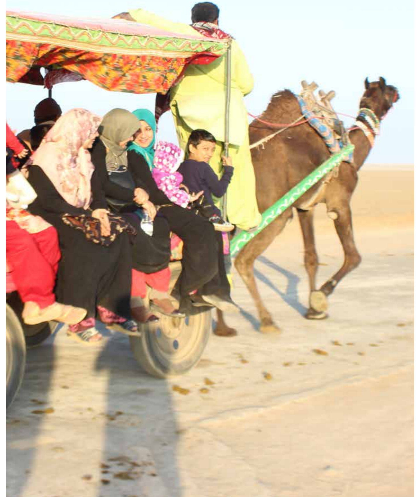
On a camel cart in 'Rann of Kutch'