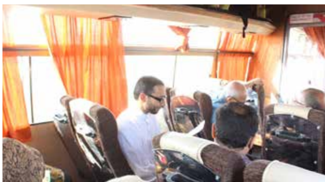
Discovering Khoja History in the Coach