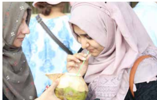
Bonding over a refreshing Coconut Drink