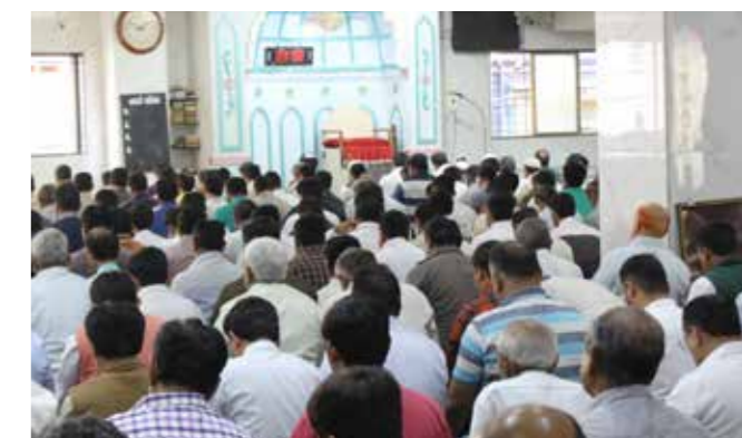
Offering Juma Prayers