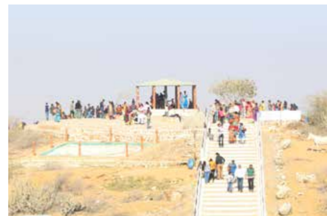
The Impressive Kala Dungar