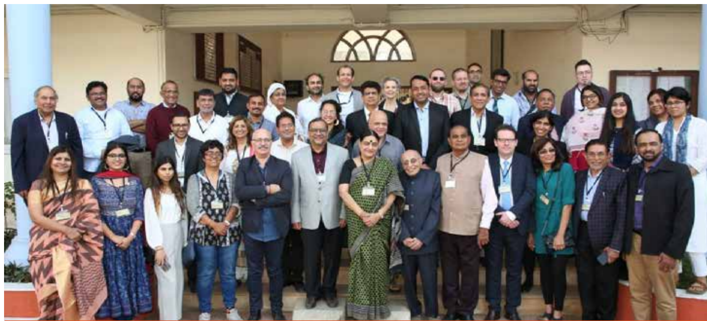
Khoja Studies Conference, Mumbai 2019