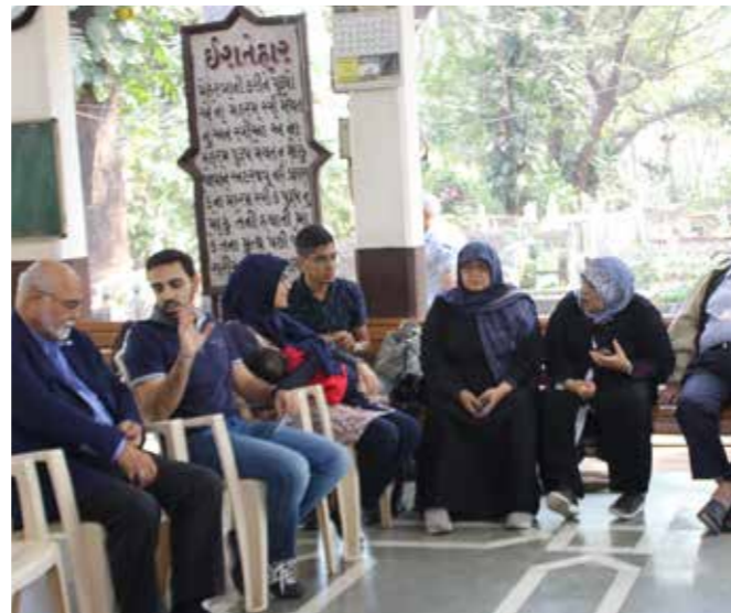
Reflection Session in Aarambaug

No wonder why our ancestors migrated to this place from Kutch and Kathiawad in early 19th century.