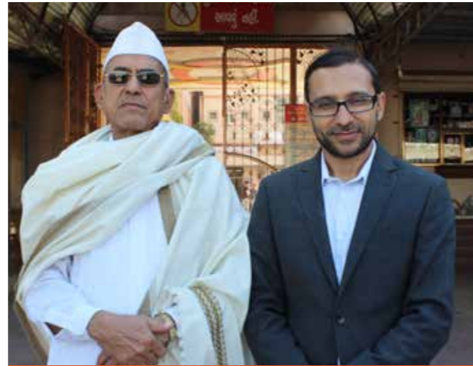
Meeting a Satpanth Saint