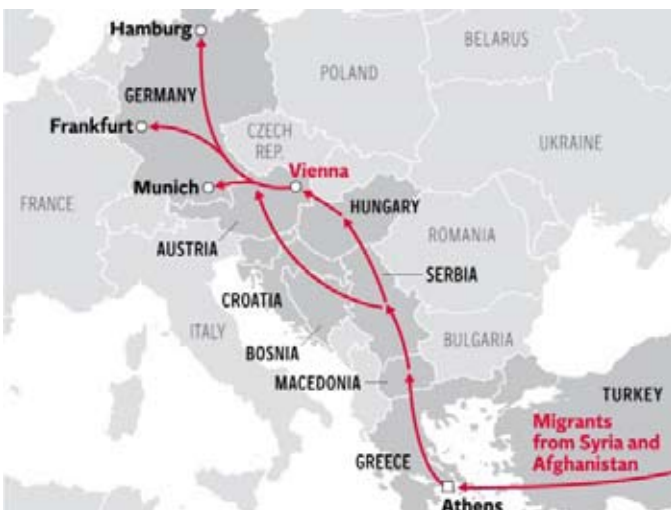
Above: A snapshot of the journey of refugees and migrants across Europe.

According to the United Nations High Commissioner for Refugees (UNHCR), the top three nationalities of the Mediterranean Sea arrivals since the beginning of the year are Syrian (53%), Afghan (16%) and Eritrean (6%).